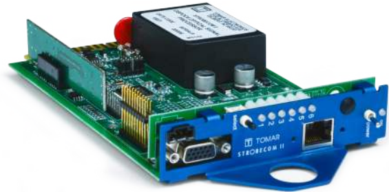
OSPOC x Family OSP

*OPTICOM and GTT are trademarks of Global Traffic Technologies, LLC and are not affiliated with Tomar Electronics, Inc. or its products