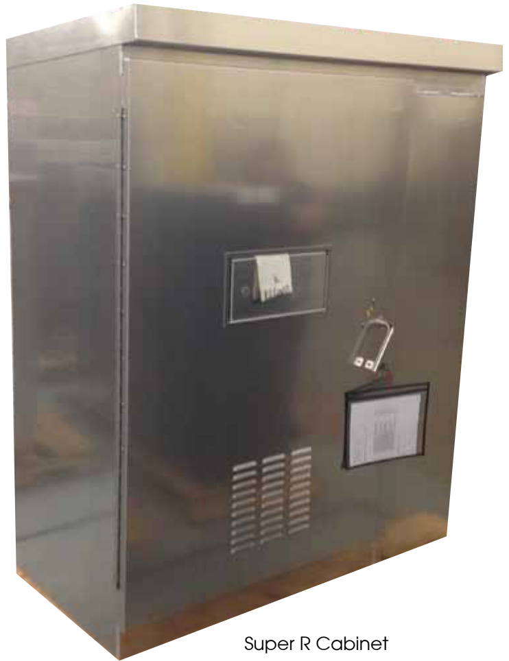
Super R Cabinet

Eagle Traffic Control Systems continues our 80+ year history of providing excellence in the ever evolving traffic industry. All of Eagle's products are developed with the highest standards of engineering and manufacturing. Eagle maintains a superior level of integrity in interactions with all of our business partners and customers. We also take tremendous pride in being model corporate citizens.