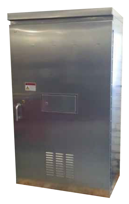
Eagle EL720 Cabinet

Eagle Traffic Control Systems continues our 80+ year history of providing excellence in the ever evolving traffic industry. All of Eagle's products are developed with the highest standards of engineering and manufacturing. Eagle maintains a superior level of integrity in interactions with all of our business partners and customers. We also take tremendous pride in being model corporate citizens.