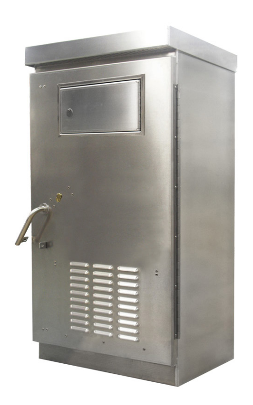
Eagle EL702 Cabinet

Eagle Traffic Control Systems continues our 80+ year history of providing excellence in the ever evolving traffic industry. All of Eagle's products are developed with the highest standards of engineering and manufacturing. Eagle maintains a superior level of integrity in interactions with all of our business partners and customers. We also take tremendous pride in being model corporate citizens.