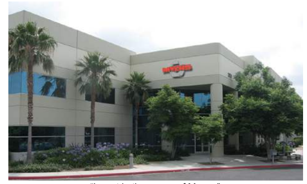
"Invest in the power of Myers."