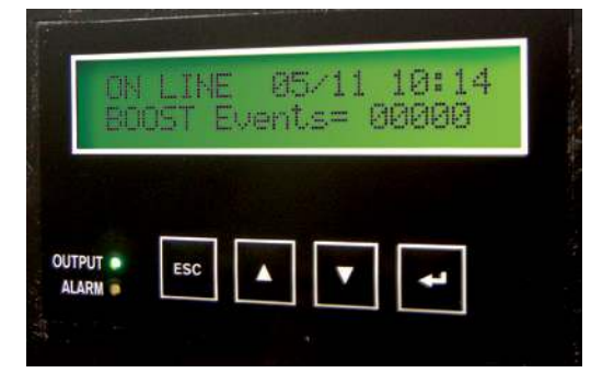
MP Series UPS Displays

Myers MP Series™ provides you with the tools to monitor and maintain your system at peak performance. The MP Series utilizes a bright LCD display and touch keys to provide real time information including input/output status, battery percentages, online and load status, time/date stamp of events, and more. Easy-to-read scrolling menus assist you with maintenance and programming of functions.