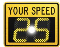
SPEEDCHECK-12 12-inch digits for speeds less than 45 mph (70 km/h)