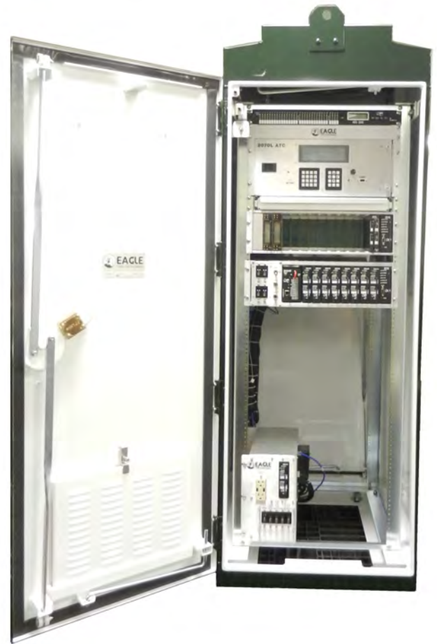
Eagle 352 ATC Cabinet

One of the primary design objectives with the ATC cabinet was safety, for both drivers and maintenance personnel. To that end, the cabinet has been designed to safeguard users from accidental shock hazard for components greater than 48V by utilizing touch safe components and guarding high voltage connections. Along with the standard voltage monitoring, the 352 ATC cabinet also includes current monitoring to improve driver safety in the event of a conflict situation. A key new feature is the ability to remove and replace the output assembly without turning the intersection dark.