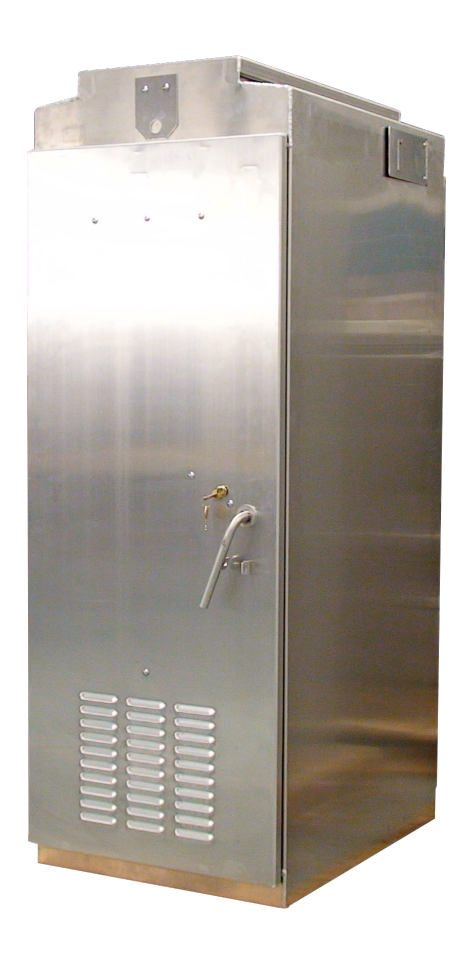
Eagle 334L Cabinet

Eagle Traffic Control Systems continues our 80+ year history of providing excellence in the ever evolving traffic industry. All of Eagle's products are developed with the highest standards of engineering and manufacturing. Eagle maintains a superior level of integrity in interactions with all of our business partners and customers. We also take tremendous pride in being model corporate citizens.