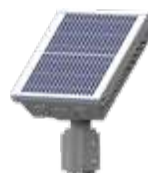
E Series Compact, integrated solar engine