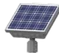
F Series Larger, integrated solar engine