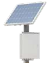
G Series Cabinet-based solar and AC systems