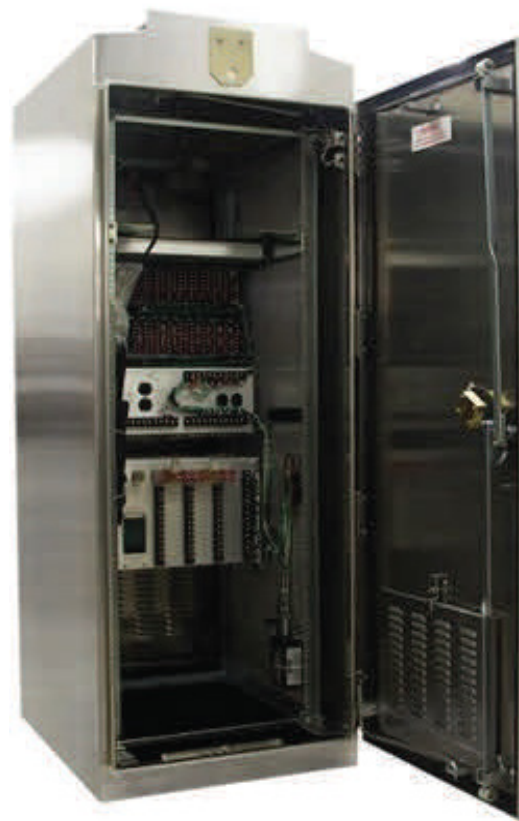
Eagle 332L Cabinet

Eagle Traffic Control Systems continues our 80+ year history of providing excellence in the ever evolving traffic industry. All of Eagle's products are developed with the highest standards of engineering and manufacturing. Eagle maintains a superior level of integrity in interactions with all of our business partners and customers. We also take tremendous pride in being model corporate citizens.