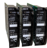
High-Density Switch Pack/Flasher Unit EDI Model 2202-HV or LV