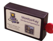
DataKey Programmer EDI Model MonitorKey