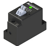
Main Contactor Struthers-Dunn Model 428AXXL-48VDC